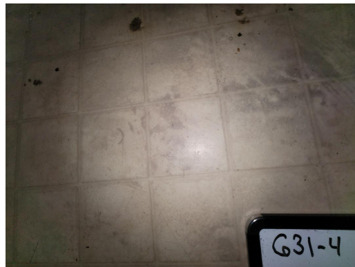
631-4 Rolled Flooring/Mastic Interior 631 Kitchen/Bathroom