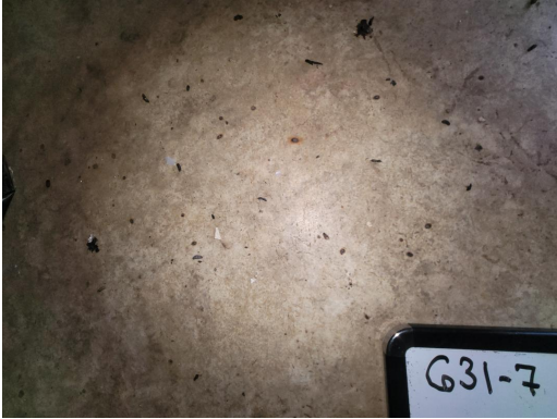
631-7 Rolled Flooring/Mastic Interior 633 Kitchen/Bathroom