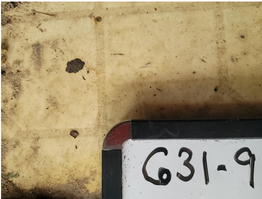
631-9 Rolled Flooring/Mastic Interior 633 Living Room