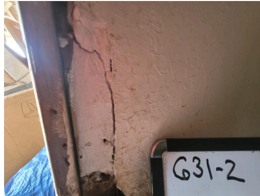
631-2 Drywall Typical Interior Walls/Ceilings