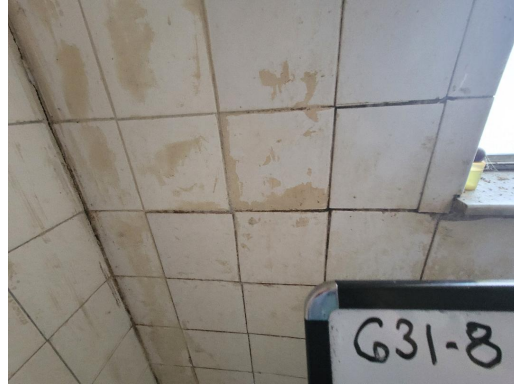
631-8 Ceramic Tile/Grout/Glue Interior 633 Bathtub Surround