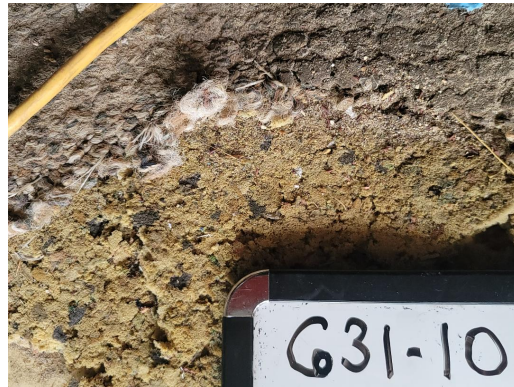
631-10 Carpeting/Padding Typical Interior