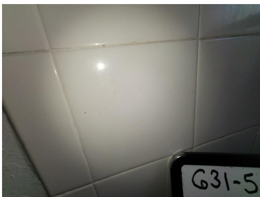
631-5 Ceramic Tile/Grout/Glue Interior 631 Bathtub Surround