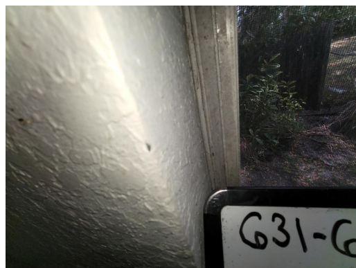
631-6 Caulk Typical Interior Windows