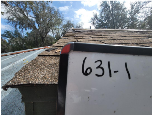
631-1 Asphalt Shingle Typical Exterior Roof